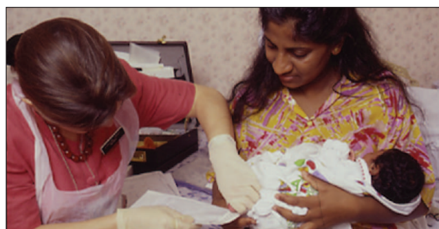
A mother watches as a sample of blood is taken from her baby's heel

"Sickle cell disease and thalassaemia have a similar prevalence among newborn babies as cystic fibrosis, but there is far less awareness of these disorders among both doctors and the general public," she said. "One of the aims of the programme is to raise awareness of these disorders and improve understanding of how it is carried and passed on." □